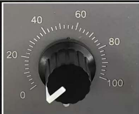
10 - 100% DIM